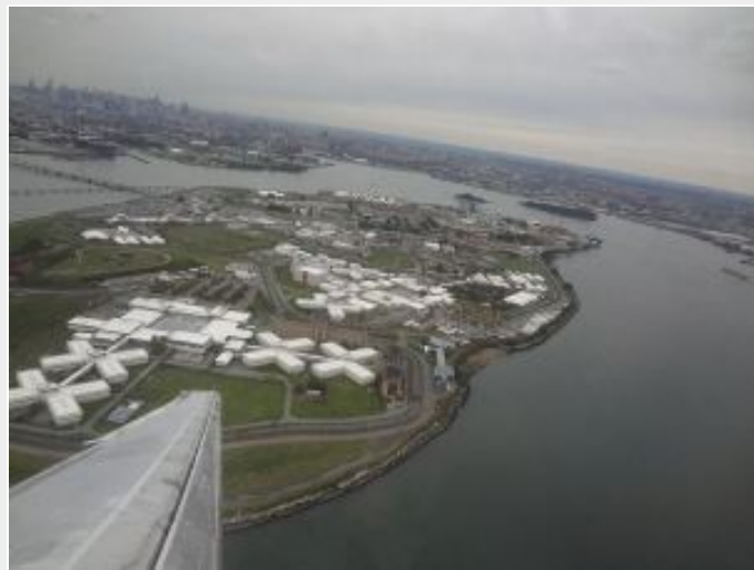
Aerial view of Riker's Island and Jail October 10, 2012

In April 2012, several adolescent inmates held at a juvenile jail on New York City's Rikers Island got into an argument and started throwing a storage bin at each other. When a corrections officer came into the room to restore order, he tried to handcuff one of them. The young man stood up, and the officer hit him in the face, delivering multiple roundhouse punches while two other officers stood by—the boy suffered multiple injuries to his head. The officer later filed a false report claiming that the teen had pushed him and that he'd defended himself by hitting the boy in the chest. But the